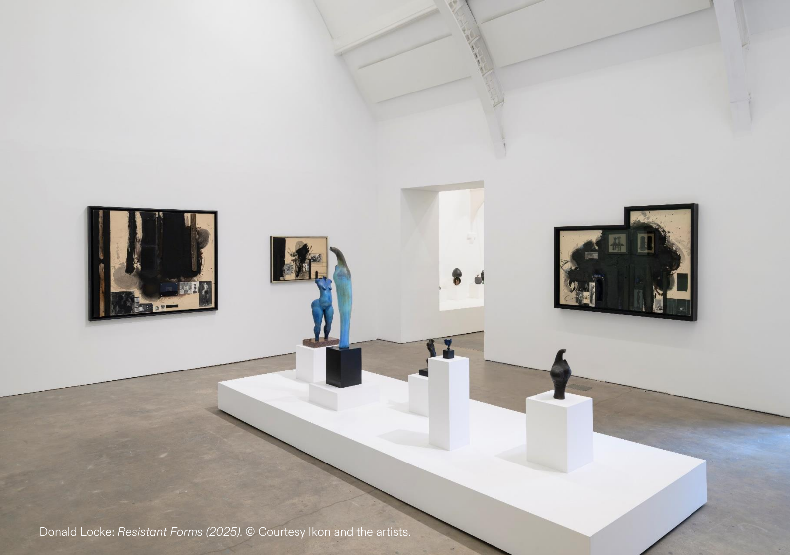
Donald Locke: Resistant Forms (2025). © Courtesy Ikon and the artists.