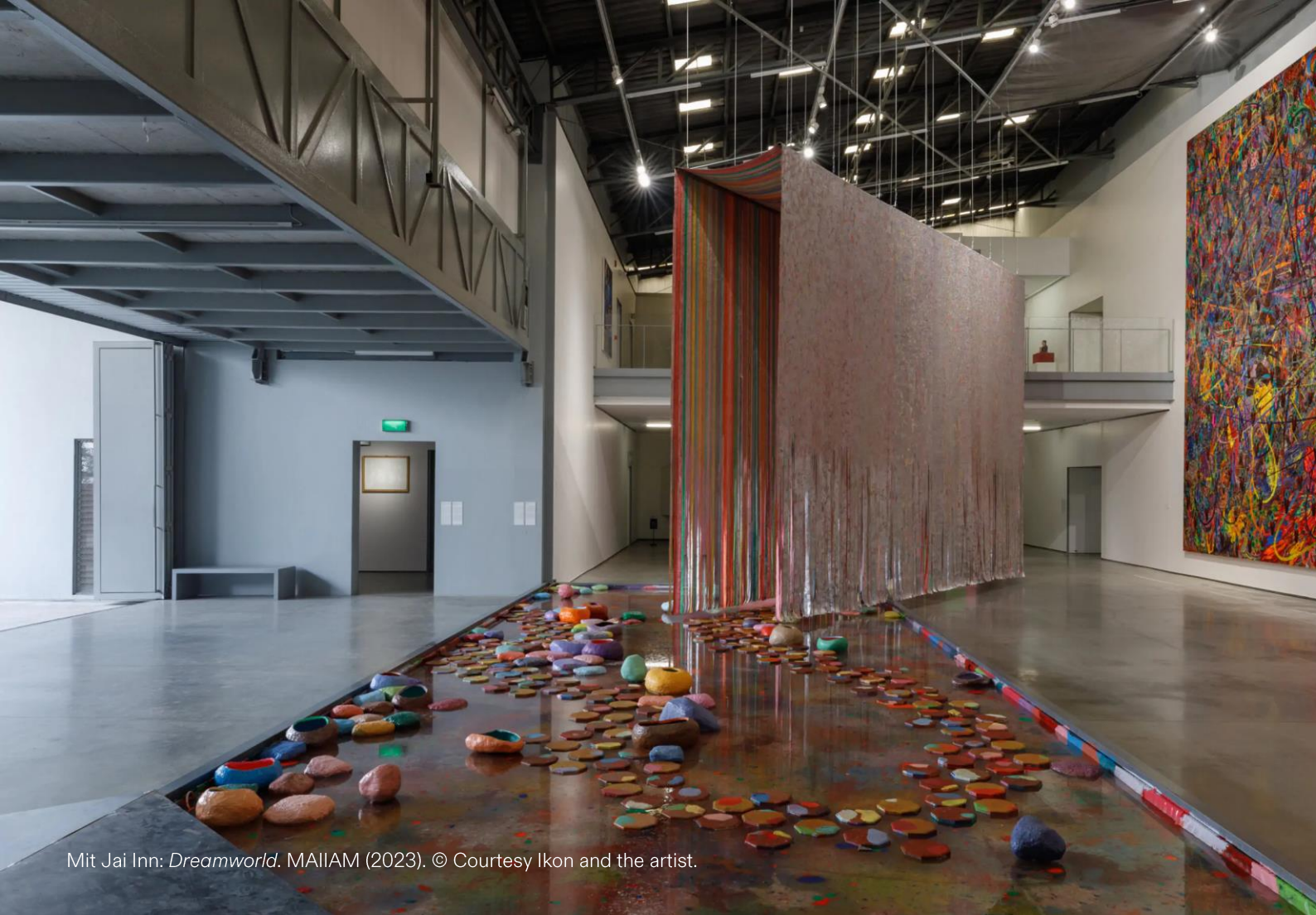
Mit Jai Inn: Dreamworld . MAIIAM (2023).