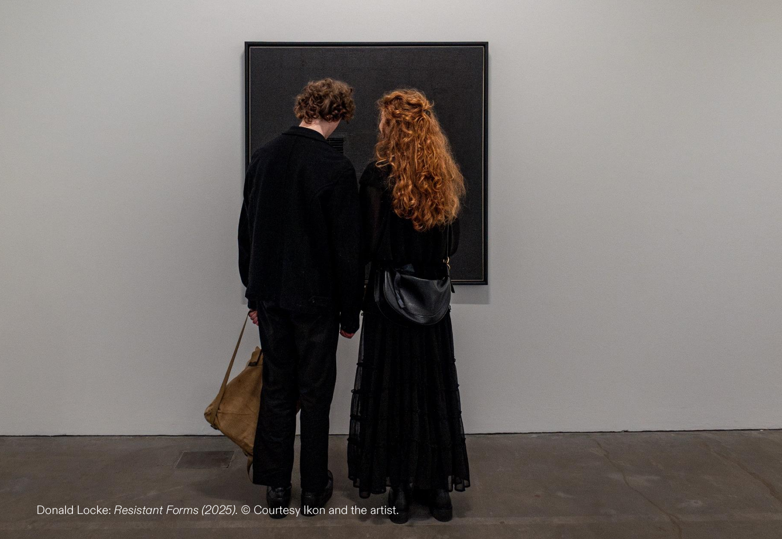
Donald Locke: Resistant Forms (2025).