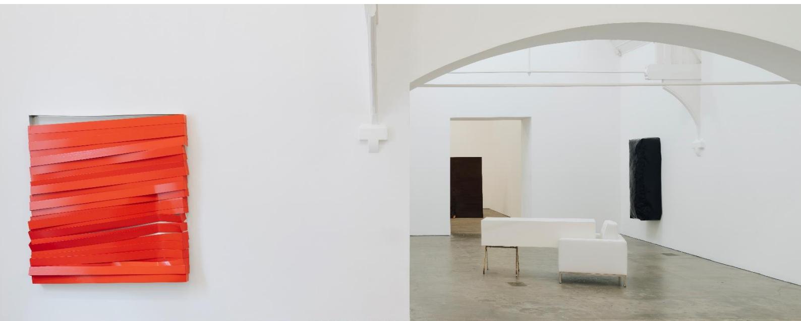
Angela de la Cruz: Upright (2026). © Courtesy Ikon and the artist.