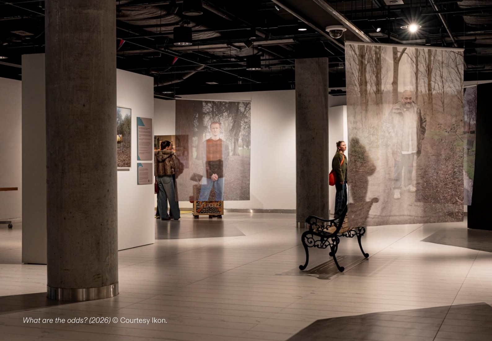
What are the odds? (2026)