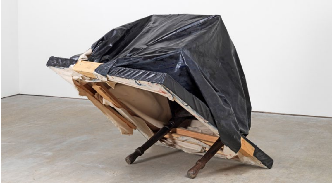
Angela de la Cruz, Still Life With Table (2000), oil on canvas, wood, 90 x 105 x 100 cm

ANGELA DE LA CRUZ: UPRIGHT 25 MARCH – 6 SEPTEMBER 2026 IKON GALLERY