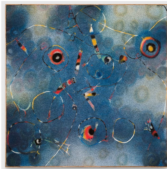
Balraj Khanna, New play (1984). Acrylic and sand on canvas, 180 x 180 cm © Estate of Balraj Khanna. Image courtesy Jhaveri Contemporary

In autumn 2026, Ikon presents the first major survey exhibition of artist Balraj Khanna (1939-2024). Coinciding with the 25th anniversary of Khanna's landmark commission for Birmingham Hippodrome Safety Curtain, Astral Dance (2001), the exhibition traces the evolution of Khanna's unique vision of abstraction, shaped by his youth in the Punjab region of India, life in post-war Britain, and fascination for the natural world.