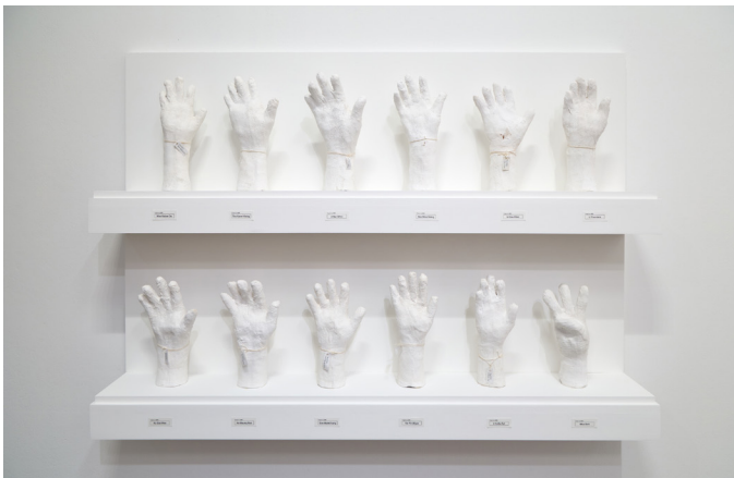
Htein Lin A Show of Hands (2013-) Installation view, Ikon Gallery (2025)