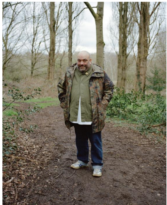
Left: Sally Butcher, Infertile Platitudes of Embodied Emptiness: Sonogram 3/9 (2020). Archival inkjet digitised monoprint. Image courtesy the artist. Right: Jaskirt Dhaliwal-Boora, Alan (2024). Image courtesy the artist.

Ikon presents a programme of exhibitions and events that engage audiences in dialogue about health and wellbeing. Conversations range from infant feeding in public spaces and the medicalisation of maternal bodies to the impact of natural environments on our physical and mental health. The programme contributes a comprehensive evidence base to inform policy development for Birmingham City Council Public Health, such as a creative health strategy.