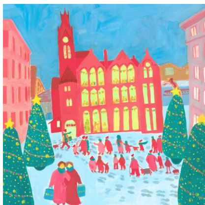
Ikon Gallery, Christmas 2023.

Perfect for any artist on the go, this pocket sized A6 sketchbook is made from recycled material by the ethical Birmingham-based makers Punks and Chancers.