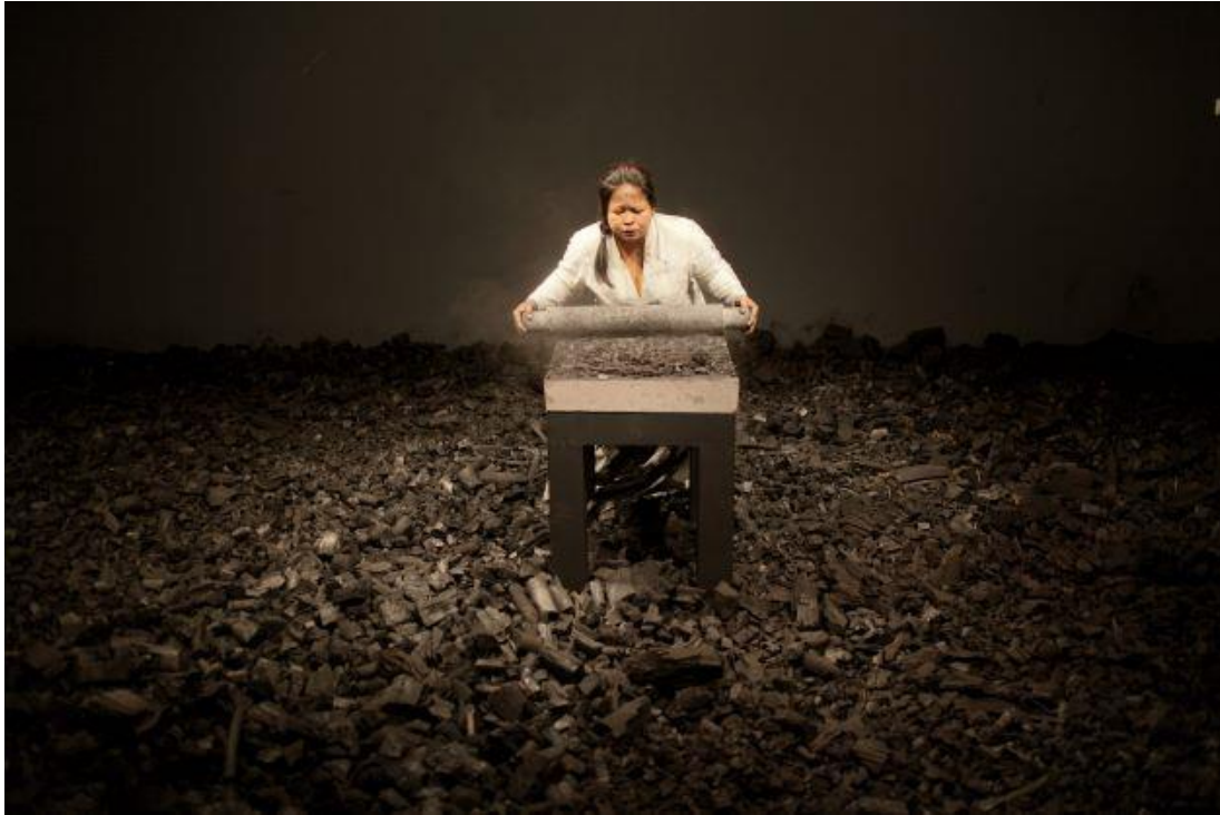
Melati Suryodarmo, I'm a Ghost in My Own House . Performed at Lawangwangi Foundation, Bandung, 2012.

In summer 2023, Ikon transforms its galleries into a platform for performance art, with the first UK exhibition by acclaimed Indonesian performance artist Melati Suryodarmo.