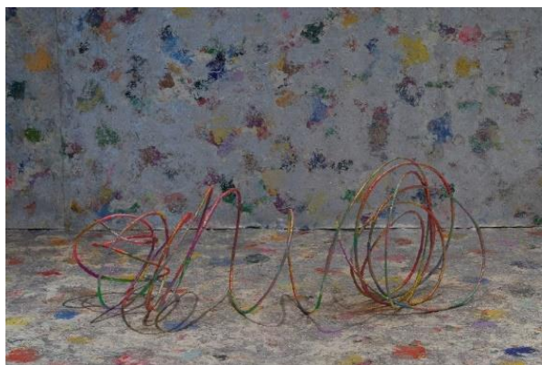
Installation view, Mit Jai Inn, Dreamworld (2021).

In 2021 Ikon presented Dreamworld , the first major solo exhibition in Europe by leading Thai artist Mit Jai Inn. Ikon now collaborates with MAIIAM Contemporary Art Museum, Chiang Mai to present Dreamday , a solo exhibition by Mit Jai Inn at Jim Thompson Art Center, Bangkok (December 2022 – February 2023). Dreamworld then tours to MAIIAM Contemporary Art Museum, Chiang Mai (March 2023 – February 2024).