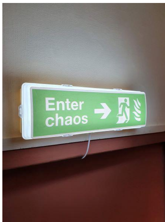
Foka Wolf, Enter chaos (2019).

Birmingham-based artist and activist Foka Wolf creates a gallery installation and billboard campaign that illustrates the invisibility of people with learning disabilities and / or autistic people in long-stay hospitals. Known for his ‘subvertisements’, which parody corporate and political posters, Foka Wolf’s interventions make us question our city’s infrastructure and whether it is meeting the needs of our community.