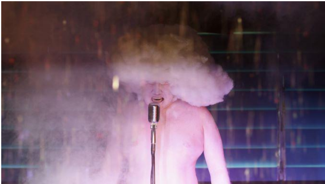
Ho Tzu Nyen, The Cloud of Unknowing (2011).

HD projection, 13 channel sound, smoke machines, floodlights, show control system.