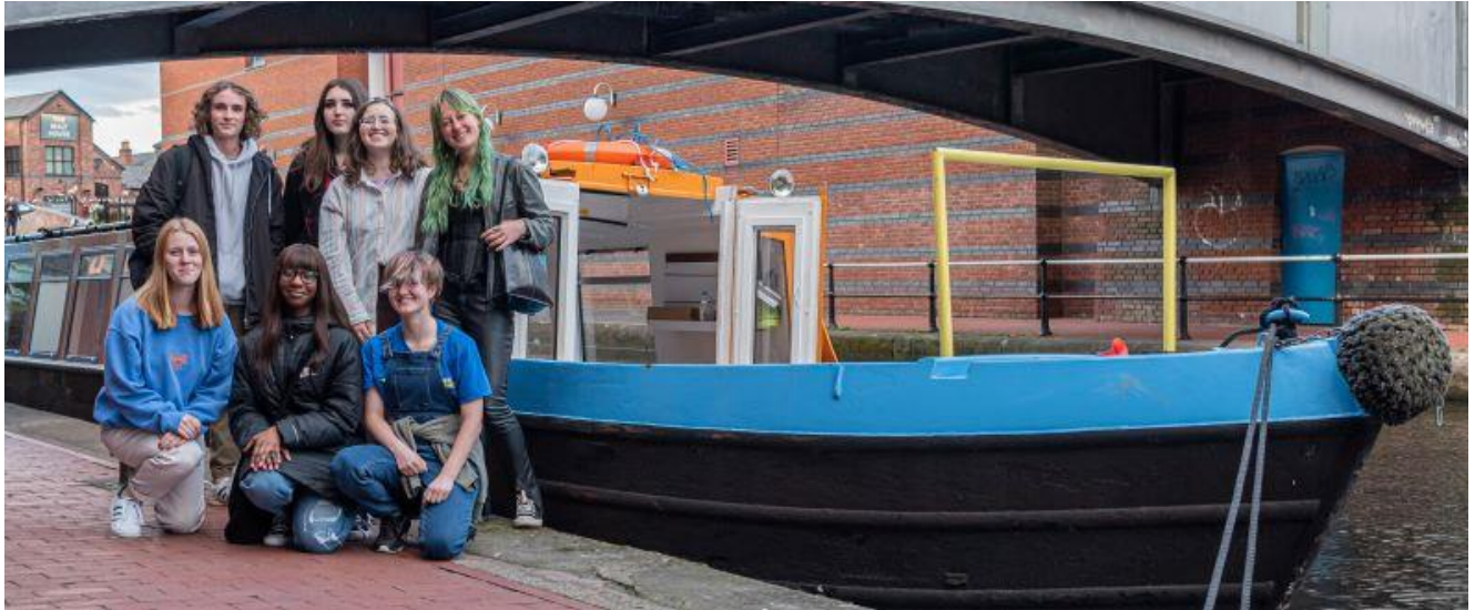
Ikon Youth Programme with Slow Boat .

Ikon Youth Programme (IYP) are a group of young people aged 16-21. Together they make artwork, meet artists, publish writing and organise events.