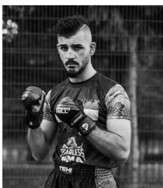
Top left: Nas delivered (2021)