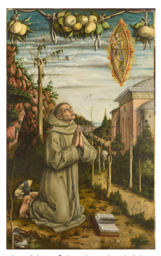
The Vision of the Blessed Gabriele (c. 1489)