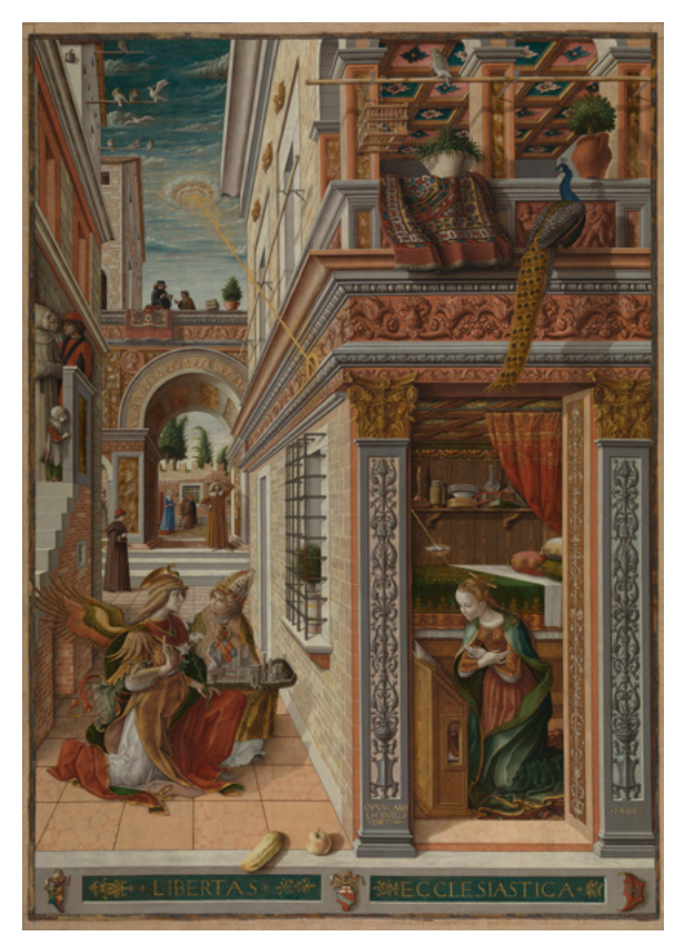
The Annunciation, with Saint Emidius (1486)