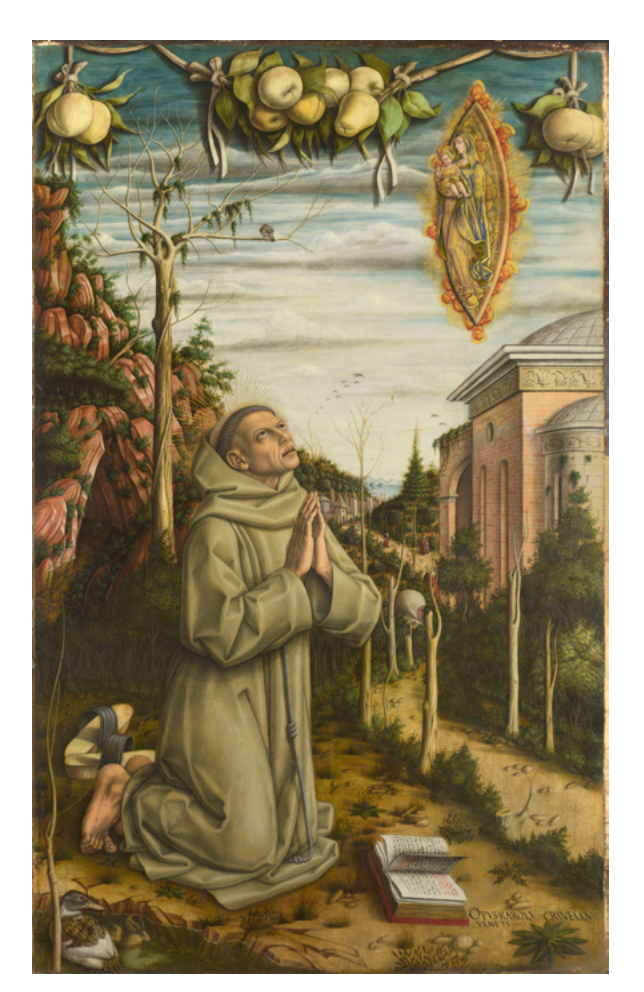
The Vision of the Blessed Gabriele (c. 1489)

Does this feel like a scene from our world or a different world?