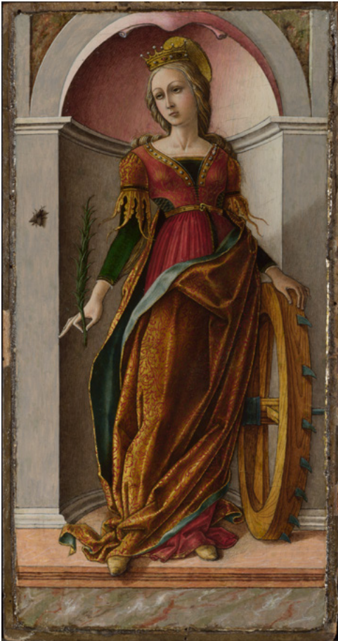
Saint Catherine of Alexandria (c. 1491–1494)