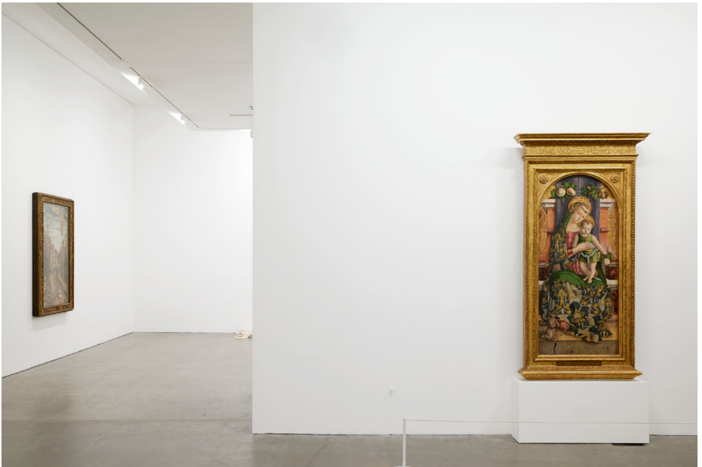
Installation view, Carlo Crivelli, Shadows on the Sky (2022), Ikon Gallery