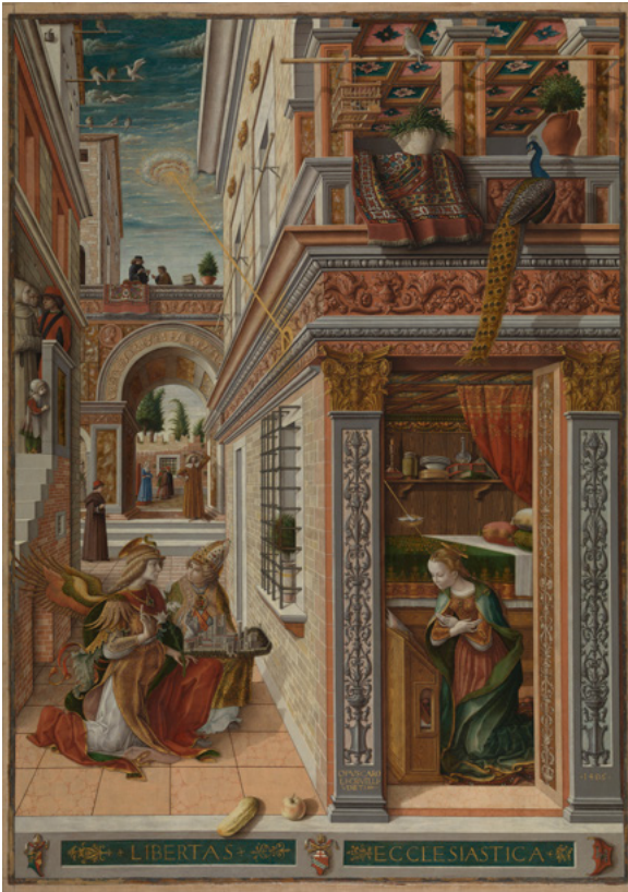
The Annunciation, with Saint Emidius (1486)

Does this feel like a scene from our world or a different world?