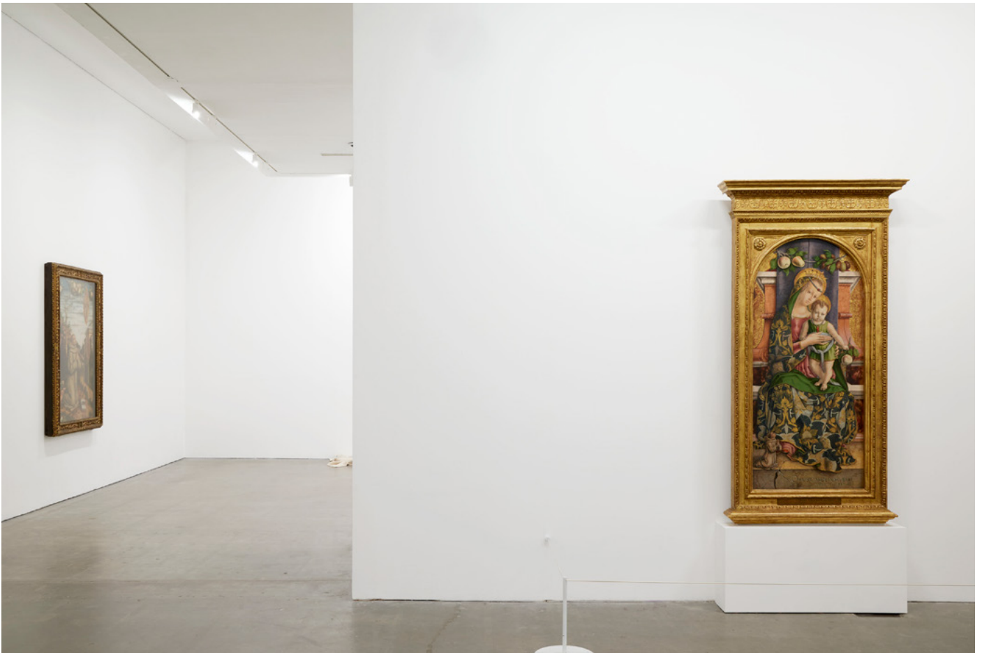
Installation view, Carlo Crivelli, Shadows on the Sky (2022), Ikon Gallery