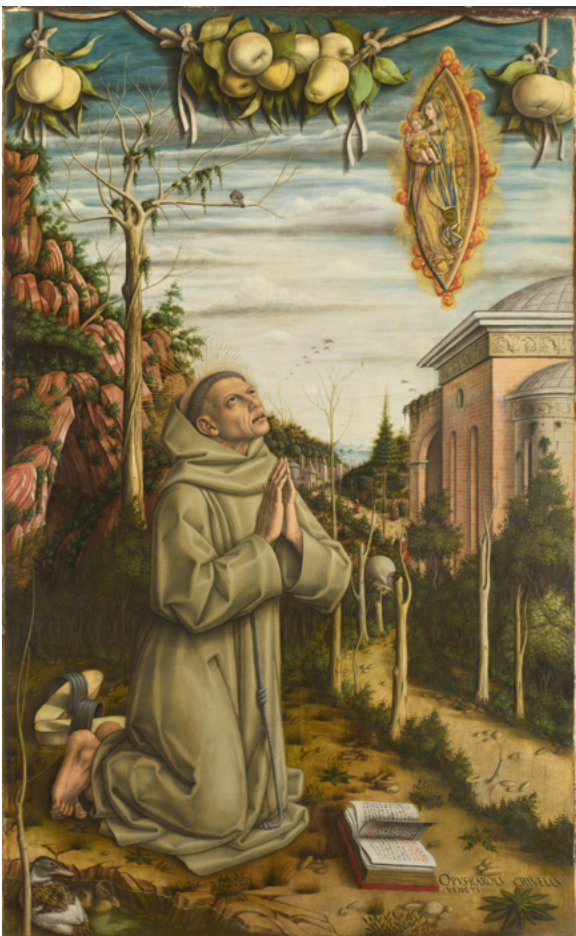
The Vision of the Blessed Gabriele (c. 1489)

What story do you think the artist is telling?