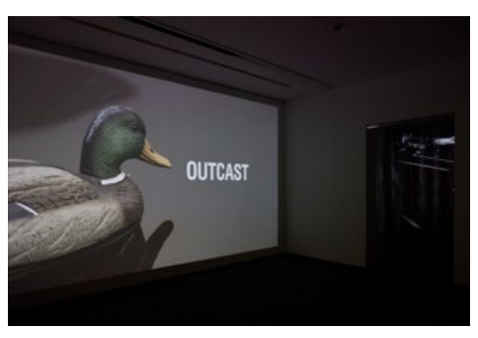
The Duck of Nature/The Duck of God (2010)

What can influence the way that we think and behave?