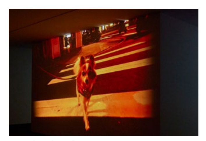
De Anima (2021)

What does the film highlight about an experience of migration? What can we learn from it?