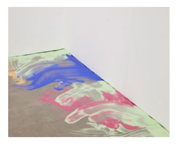
Pure Shores (2021)

Watch the film Introducing Betsy Bradley.