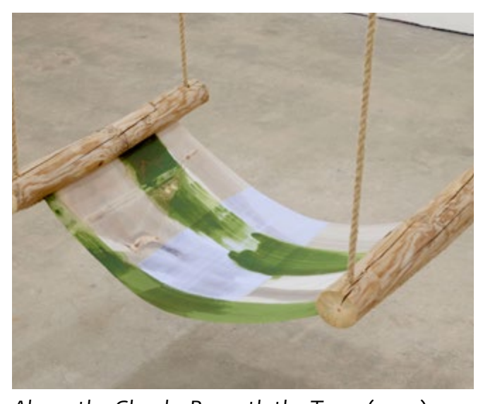
Above the Clouds, Beneath the Trees (2021)

How does the artist use fabrics to create sculptural works?