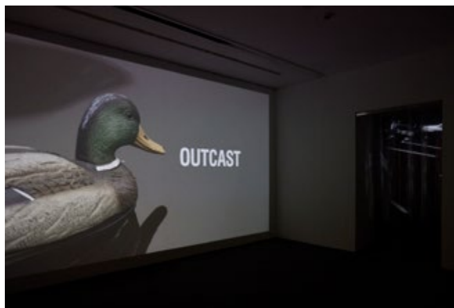
The Duck of Nature/The Duck of God (2010)

Watch the trailer James T. Hong : Animal .