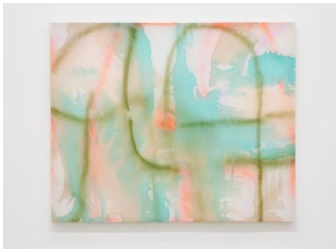
Surfing Between Dreams (2021)