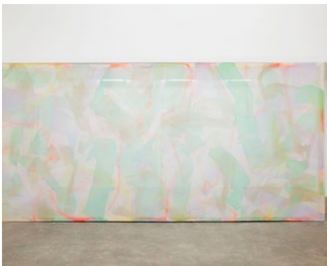
Boogie Wall (2021)