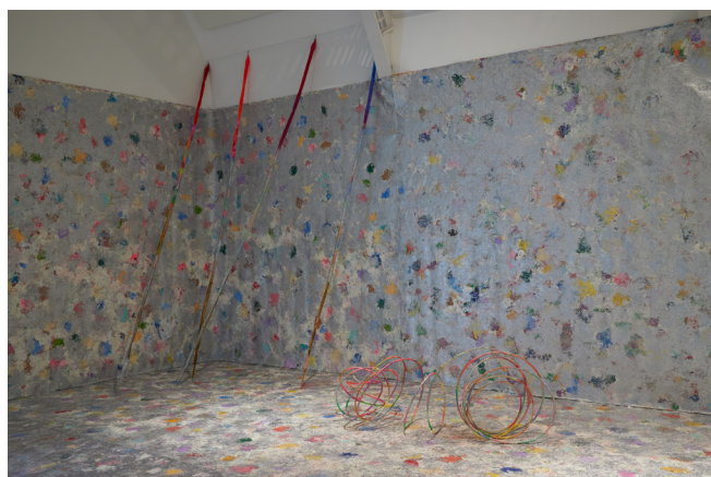
Midlands Dwelling (2021)