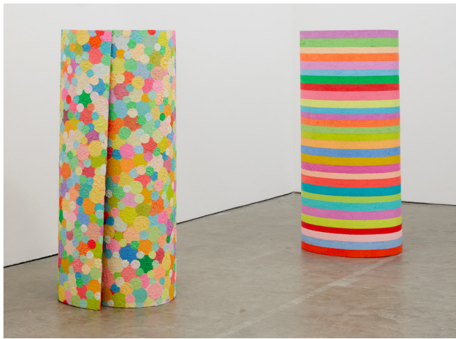
Untitled (Scroll) (2021)