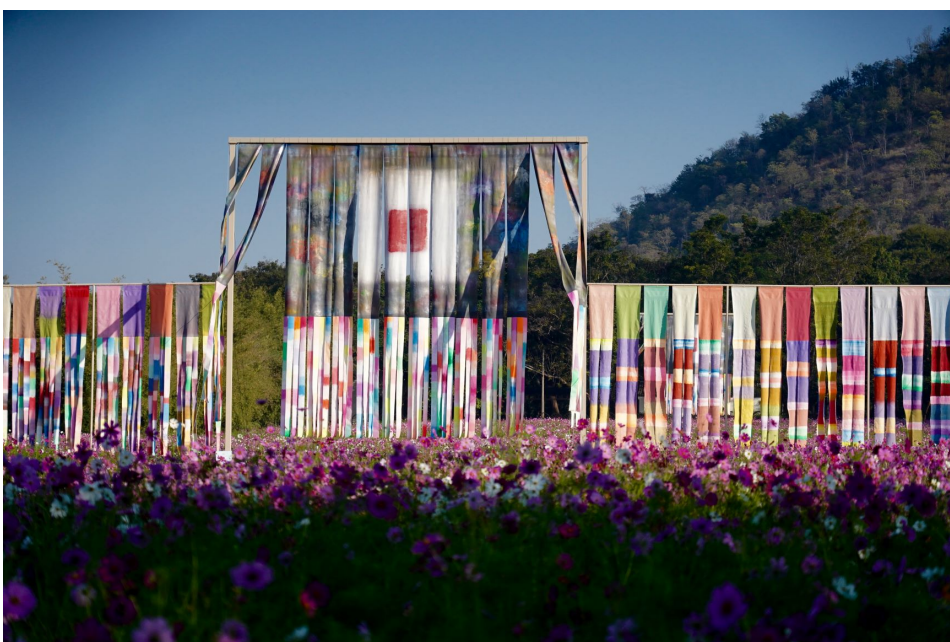
Installation view, Mit Jai Inn, People's Wall (2019).

60 sprayed canvases, 4 × 1.5 m each, dimensions variable, at Art on Farm, Jim Thompson Farm, Thailand, 2020.