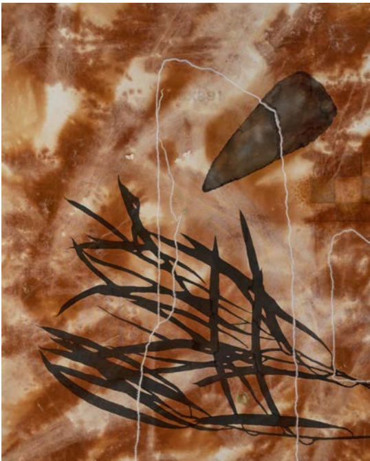
standing stones, gumbi gumbi, stone tool (2020)