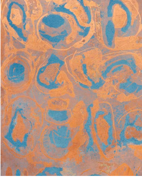
A Library of Ecological Conversations (Leaves and Me) (2017-2019)