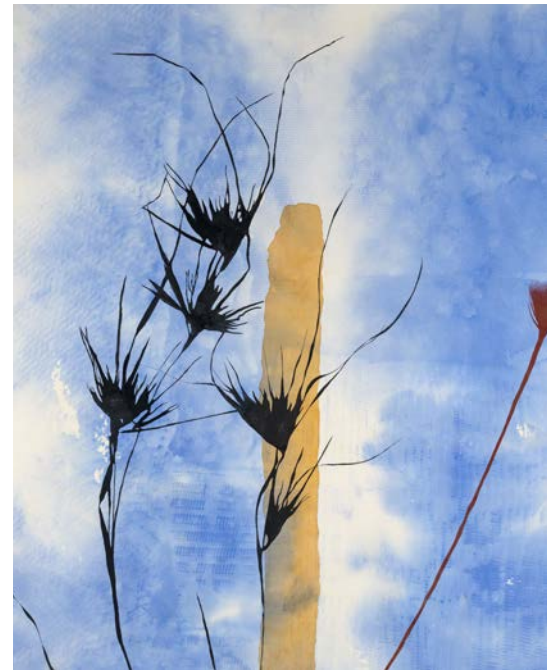
standing stone, kangaroo grass, red and yellow ochre (2020)