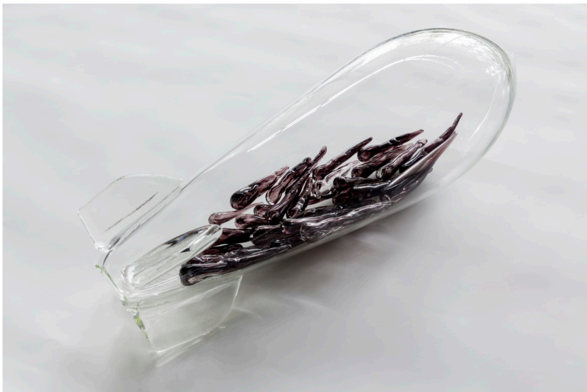
Yhonnie Scarce, Glass Bomb (Blue Danube) (2015), hand blown glass bomb and yams. Photograph by Janelle Low. Courtesy the artist and This Is No Fantasy

Ikon Gallery 1 Oozells Square, Brindleyplace, Birmingham B1 2HS 0121 248 0708 / ikon-gallery.org Open Tuesday-Sunday & Bank Holiday Mondays, 11am-5pm / free entry Registered charity no. 528892