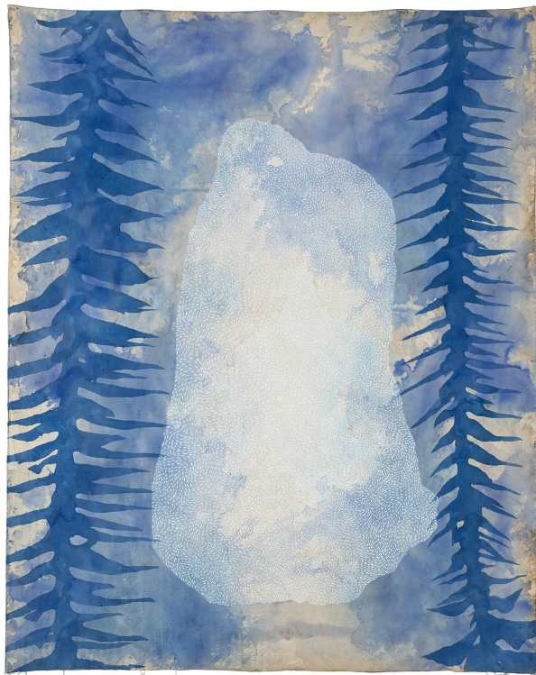
Judy Watson, standing stone with spines (2020) Acrylic, graphite on canvas Courtesy the artist and Milani Gallery

Ikon Gallery 1 Oozells Square, Brindleyplace, Birmingham B1 2HS 0121 248 0708 / ikon-gallery.org Open Tuesday-Sunday & Bank Holiday Mondays, 11am-5pm / free entry Registered charity no. 528892