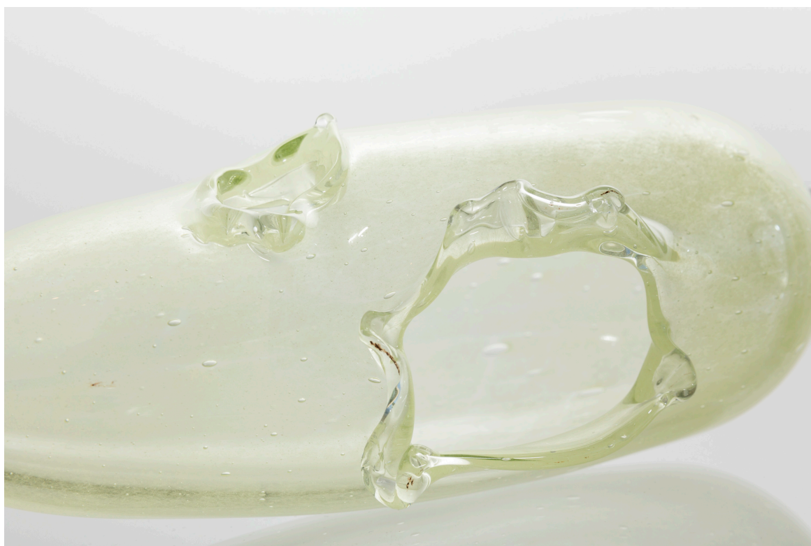
Yhonnie Scarce, Hollowing Earth (2017), hand blown uranium enriched glass. Courtesy the artist and This is No Fantasy