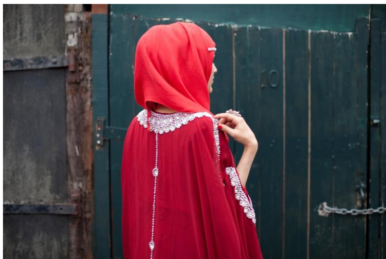
Red hijab, red dress and bling ©Mahtab Hussain From the series Honest With You (2013)

British artist Mahtab Hussain (b. 1981) explores the important relationship between identity, heritage and displacement. His themes develop through long-term research articulating a visual language that challenges the prevailing concepts of multiculturalism.