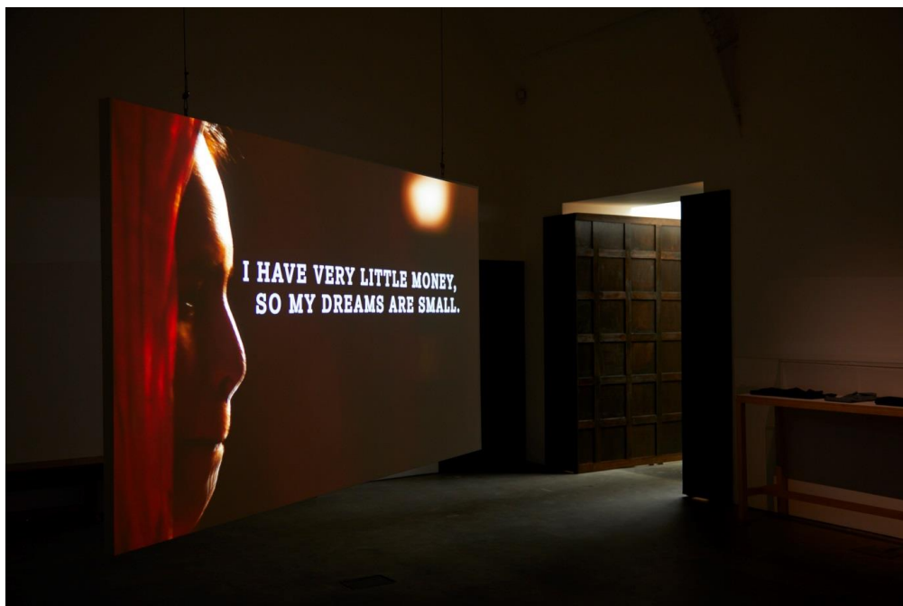
Osman Yousefzada, Being Somewhere Else . Installation Ikon Gallery (2018)

Artist and fashion designer Osman Yousefzada's work exists within what he calls a "migrant soup" aesthetic – a rich mix of theology, ritual, contemporary European art and the crossing of continental and cultural borders.