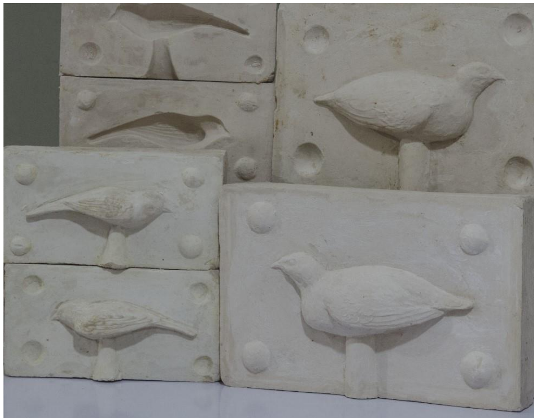
Ali Kazim, Conference of birds (2020). Production image, courtesy the artist.

Ali Kazim was born in Pakistan and currently lives and works in Lahore.