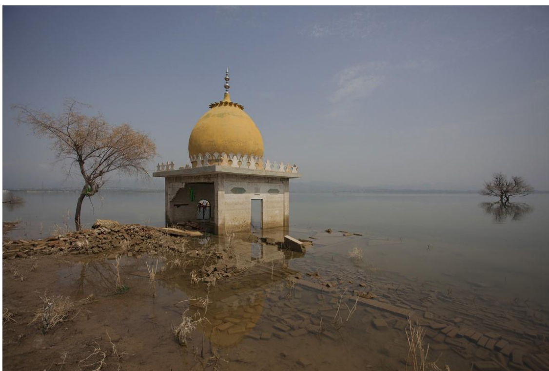
Mangla Dam From the series Going Back Home to Where I Came From (2016)