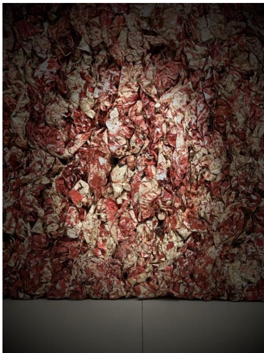
Imran Qureshi, Earth to earth, ashes to ashes, dust to dust (2020)

Imran Qureshi was born in Hyderabad, Pakistan (1972) and is one of the most important contemporary artists from the subcontinent. His work is rooted in the tradition of miniature painting, reclaiming and transporting it to the present day in site-specific installations, three-dimensional works, videos and paintings. His work combines a local background with a global outlook, artistically, socially and politically.