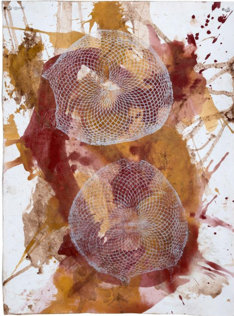
Judy Watson, myall creek mourning caps 1 (yulurri kala) (2018)

Ochre, earth, binder medium, acrylic on paper.