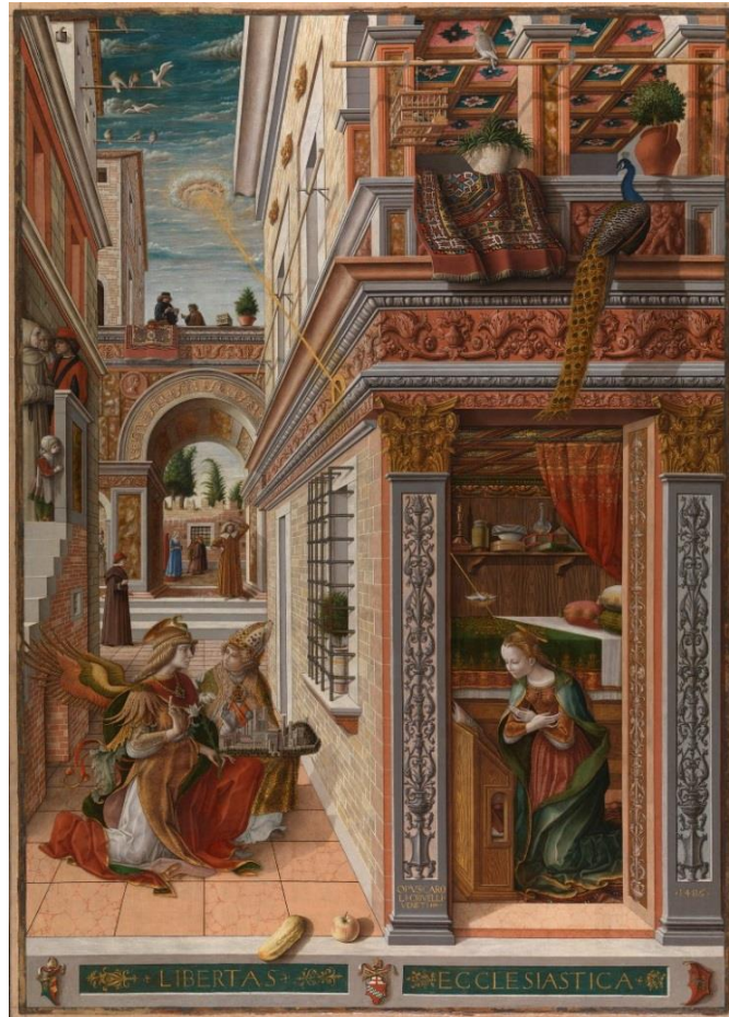
Carlo Crivelli The Annunciation, with Saint Emidius (1486) Egg and oil on canvas, 207 × 146.7 cm. Presented by Lord Taunton, 1864. NG739.

Ikon is delighted to announce winning the inaugural £125,000 Ampersand Foundation Award, which will enable the gallery to realise its dream of staging an exhibition of works by the 15th century master Carlo Crivelli. The Trustees of the National Gallery in London have agreed to lend four masterpieces by Crivelli for Ikon's presentation in Spring 2022.