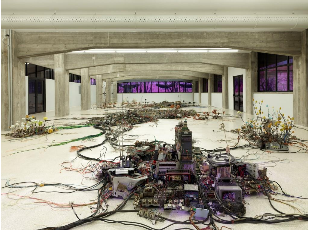
Krištof Kintera, Postnaturalia (2017).

This will be the first UK survey of work by internationally acclaimed Czech artist Krištof Kintera (b. 1973, Prague). It will include new installations for both the gallery and off-site.