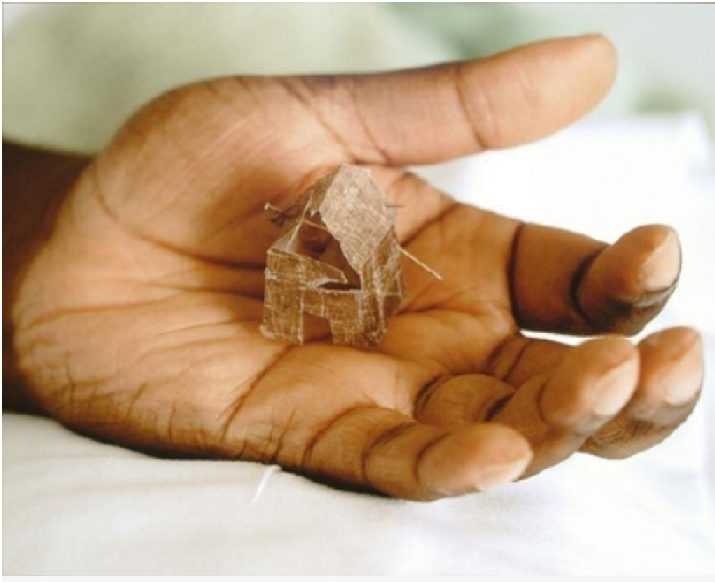
Donald Rodney, In the House of My Father (1997)

The fourth in a series of surveys of Ikon's artistic programme, this exhibition is a review of the 1990s. Comprising work by artists who featured in exhibitions and other projects at the gallery in John Bright Street during the period 1989-1997 and then at Ikon's current premises in Brindleyplace until 1999.