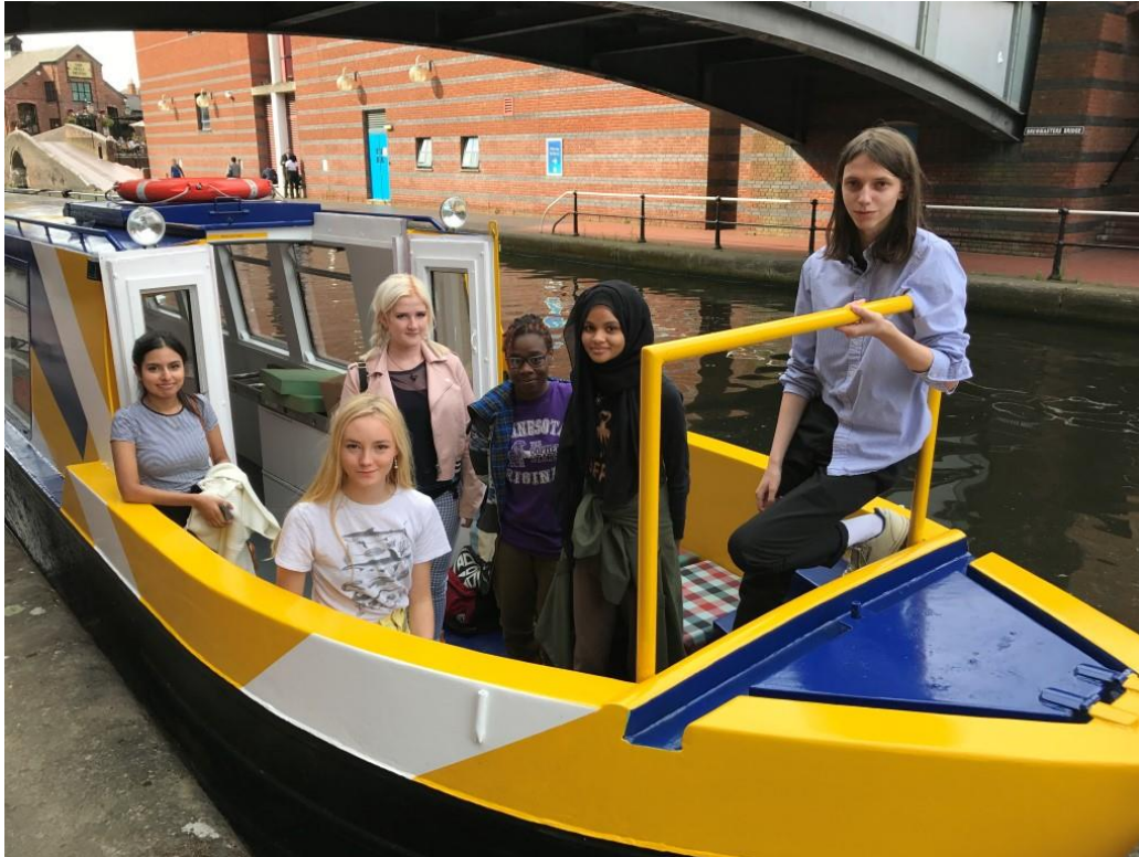
Ikon Youth Programme onboard Slow Boat

A converted narrow boat, Slow Boat is crewed by Ikon Youth Programme as a unique floating space for live performances, film screenings, a site for installation, a social space for hospitality and talks, theatrical events, and HQ for 'guerrilla' activity in locations en route and online. In 2019, Ikon celebrated 20 years of working on the canals.