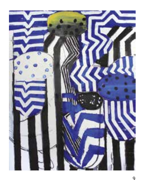
3 Meryl McMaster On The Edge of This Immensity (2019) Courtesy the artist