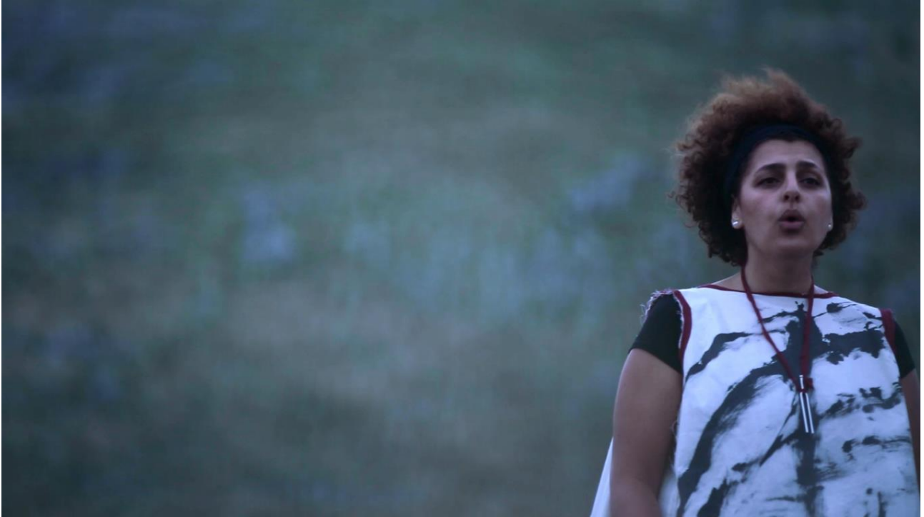
Claudia Losi, Voce a vento (2018)

Ikon Gallery 1 Oozells Square, Brindleyplace, Birmingham B1 2HS 0121 248 0708 / ikon-gallery.org Open Tuesday-Sunday & Bank Holiday Mondays, 11am-5pm / free entry Registered charity no. 528892