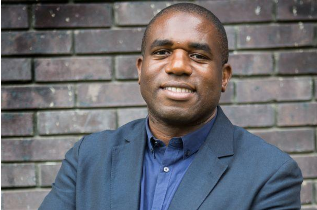
Rt Hon David Lammy MP

Ikon Gallery 1 Oozells Square, Brindleyplace, Birmingham B1 2HS 0121 248 0708 / ikon-gallery.org Open Tuesday-Sunday & Bank Holiday Mondays, 11am-5pm / free entry Registered charity no. 528892