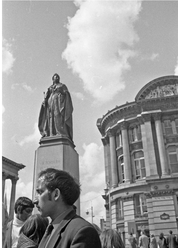
Queen Victoria's statue with a demonstrator from the Indian Workers Association Black and White Unite and Fight . (1968)

Ikon hosts The Migrant Festival , a four day festival fusing visual art, music, film and performance.