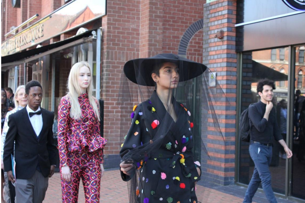
Osman Yousefzada fashion parade (2018)

Ikon Gallery 1 Oozells Square, Brindleyplace, Birmingham B1 2HS 0121 248 0708 / ikon-gallery.org Open Tuesday-Sunday & Bank Holiday Mondays, 11am-5pm / free entry Registered charity no. 528892