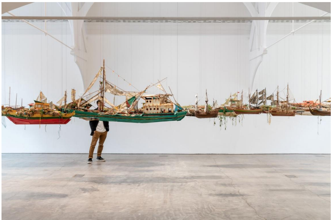
Hew Locke: Here's the Thing (2019), Ikon. Courtesy the artist and Ikon