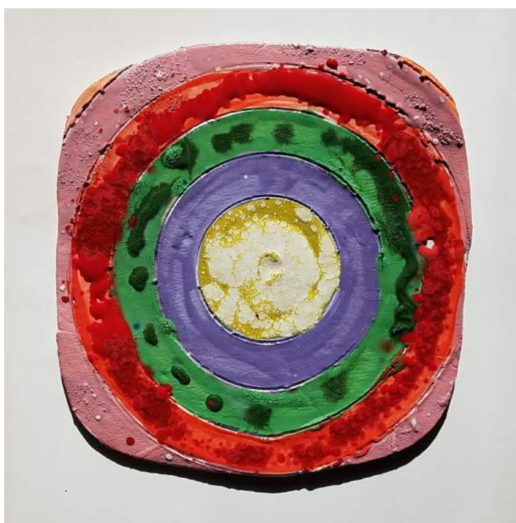
Polly Apfelbaum, Aquarius (2018). Ceramic and glaze, courtesy the artist and Frith Street Gallery, London

Ikon presents a major exhibition of new and recent work by internationally renowned New York-based artist Polly Apfelbaum (born 1955), 19 September — 18 November 2018. Entitled Waiting for the UFOs (a space set between a landscape and a bunch of flowers) , the exhibition exemplifies Apfelbaum's interest in "space, obsession and otherness". Featuring large-scale colourful installations comprising textiles, ceramics and drawings, Apfelbaum's practice is framed within wider sociological and political contexts, and the legacy of post-war American art.