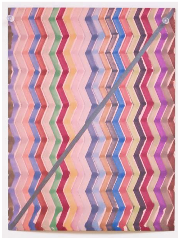
Polly Apfelbaum, Basic Division (Wavy Gravy) (2012). Marker pen on paper, courtesy the artist and Frith Street Gallery, London. © Polly Apfelbaum