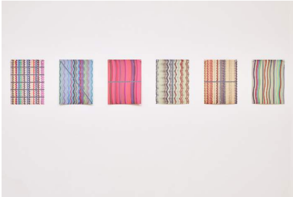
Polly Apfelbaum, Basic Division (Wavy Gravies) (2012). Marker pen on paper, courtesy the artist and Frith Street Gallery, London. © Polly Apfelbaum

Ikon Gallery 1 Oozells Square, Brindleyplace, Birmingham B1 2HS 0121 248 0708 / www.ikon-gallery.org Open Tuesday-Sunday & Bank Holiday Mondays, 11am-5pm / free entry Registered charity no. 528892