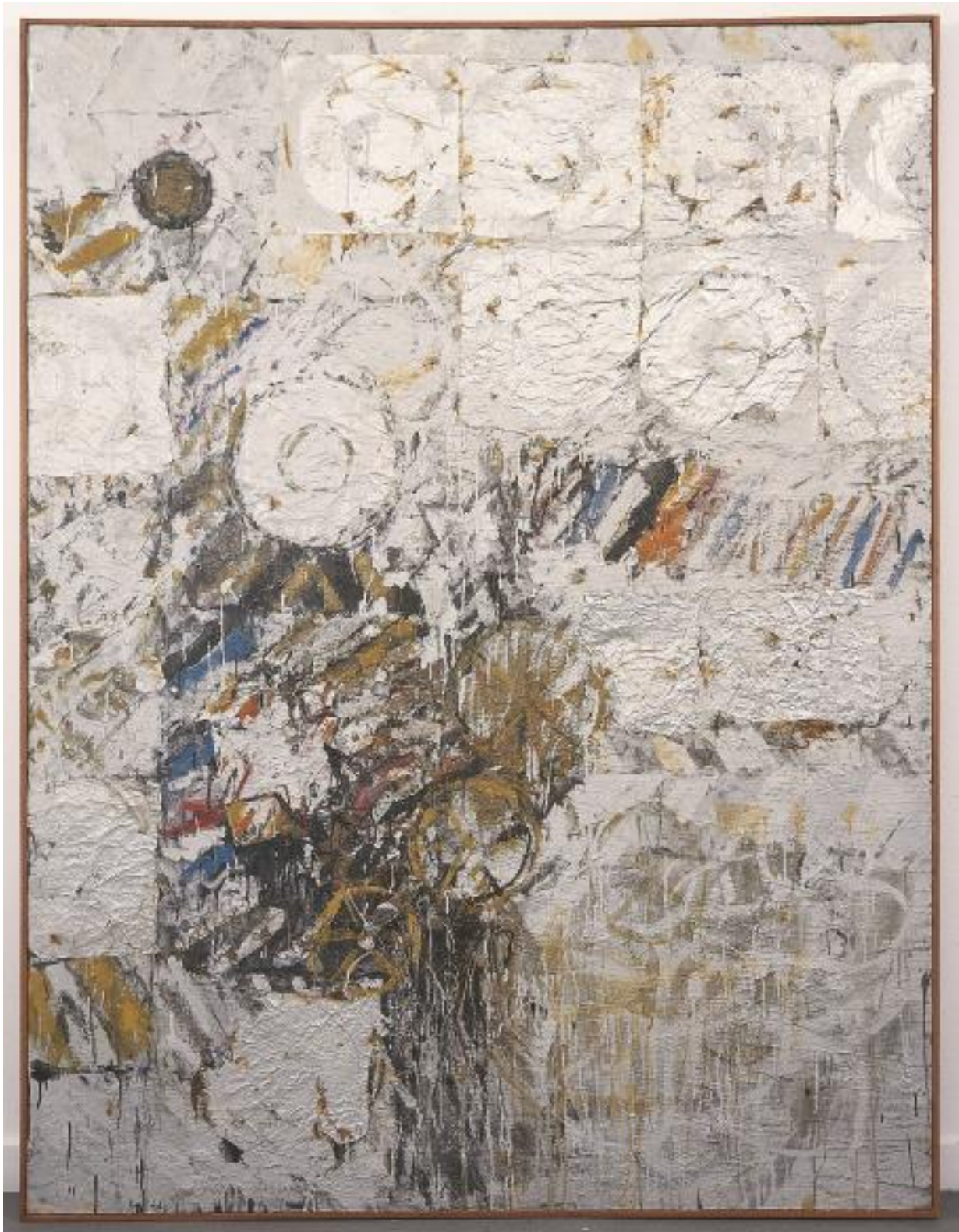
John Salt, Silver Ghost (c.1965). Painting and collage.

Ikon Gallery 1 Oozells Square, Brindleyplace, Birmingham B1 2HS 0121 248 0708 / www.ikon-gallery.org Open Tuesday-Sunday & Bank Holiday Mondays, 11am-5pm / free entry Registered charity no. 528892