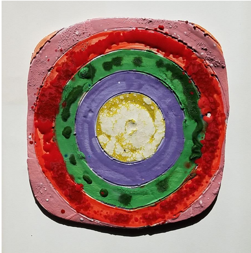
Polly Apfelbaum, Aquarius (2018).

Ikon's Autumn exhibition of new work by New York-based artist Polly Apfelbaum will exemplify an art practice that places emphasis on the essential quality of materials, especially colour and texture, whilst asserting the importance of popular culture and craft activity. Her use of various fabrics – stained and dyed – and more recently glazed ceramics, is beguiling and refreshing in its offerings of simple pleasures. In this way, she subtly assumes a political, and feminist, position, challenging pomposity, notions of entitlement and hierarchies in cultural practice – against “high” fine art – to suggest an egalitarianism in society across the board.