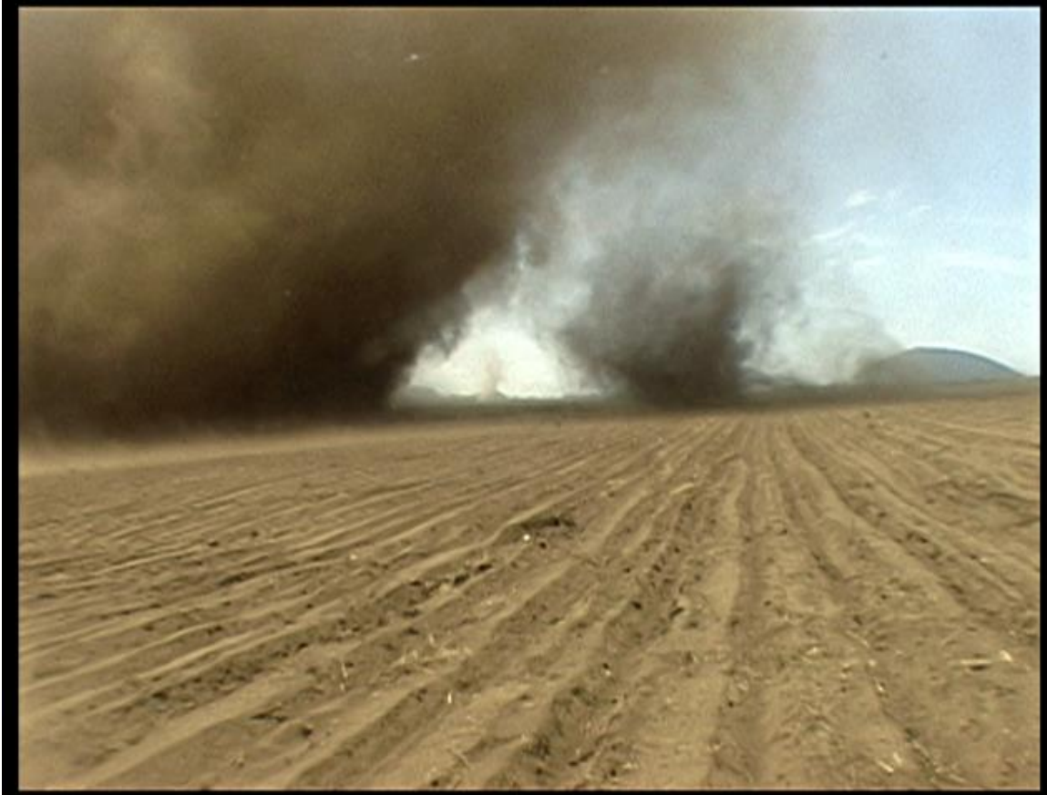
Francis Alÿs, Tornado, Milpa Alta (2000-10) Video documentation of an action, 55mins

Francis Alÿs Knots'n Dust 20 June – 9 September 2018