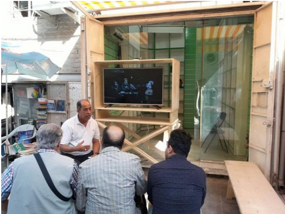
The Ruya Shop, Baghdad, Iraq