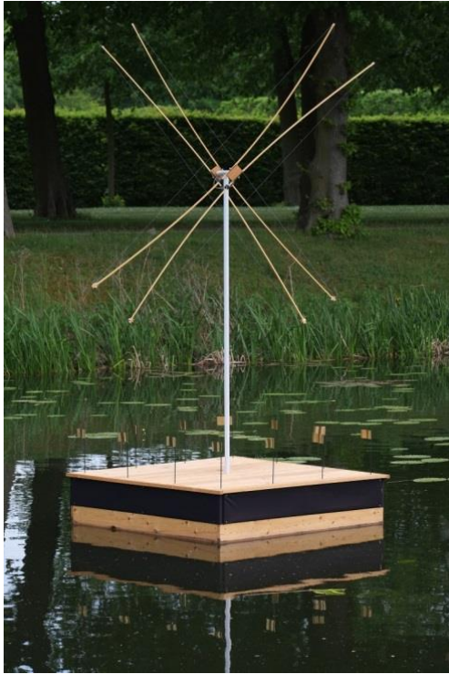
Max Eastley, Wind Sounds , KunstFestSpiele Festival, Herrenhausen Gardens, Hanover, Germany, 2016. 4