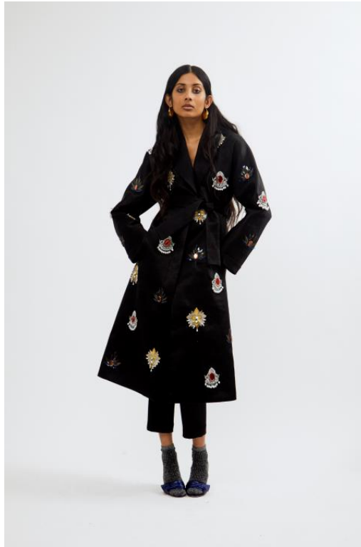
OSMAN. Pre-Fall collection 18