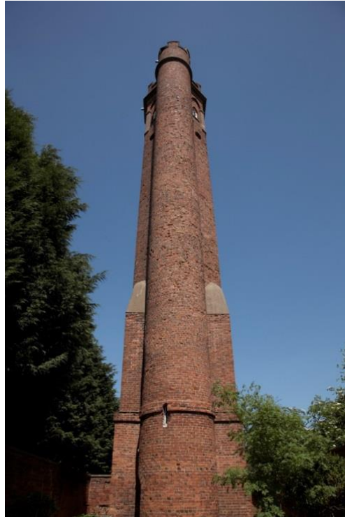
Perrott's Folly, Birmingham

Max Eastley is an internationally recognised artist who combines kinetic sculpture and sound into a unique art form. His sculptures exist on the border between the natural environment and human intervention and use the driving forces of electricity, wind, water and ice.