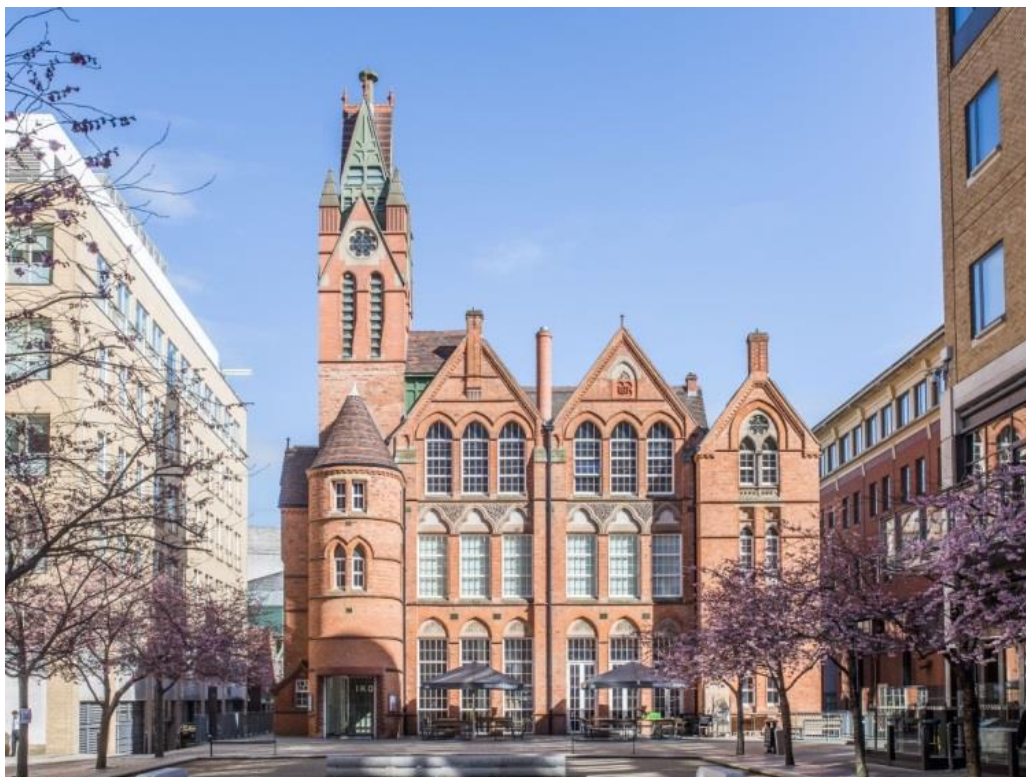
Ikon Gallery.

Ikon's Spring exhibitions open on 21 March 2018, exactly 20 years to the day since the gallery opened the doors to its current home in Brindleyplace on 21 March 1998.