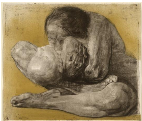
Käthe Kollwitz (1867–1945) Woman with Dead Child (1903) Soft-ground etching with engraving overprinted lithographically with gold tone-plate

Ikon's exhibition of work by Käthe Kollwitz, a leading artist of the late nineteenth and early twentieth centuries, ran 13 September–26 November 2017. Organised in partnership with the British Museum it tours to Young Gallery, Salisbury (9 December 2017–11 March 2018); Glynn Vivian Art Gallery, Swansea (24 March–17 June 2018); Ferens Art Gallery, Hull (30 June–30 September 2018) and British Museum (September 2019–January 2020).