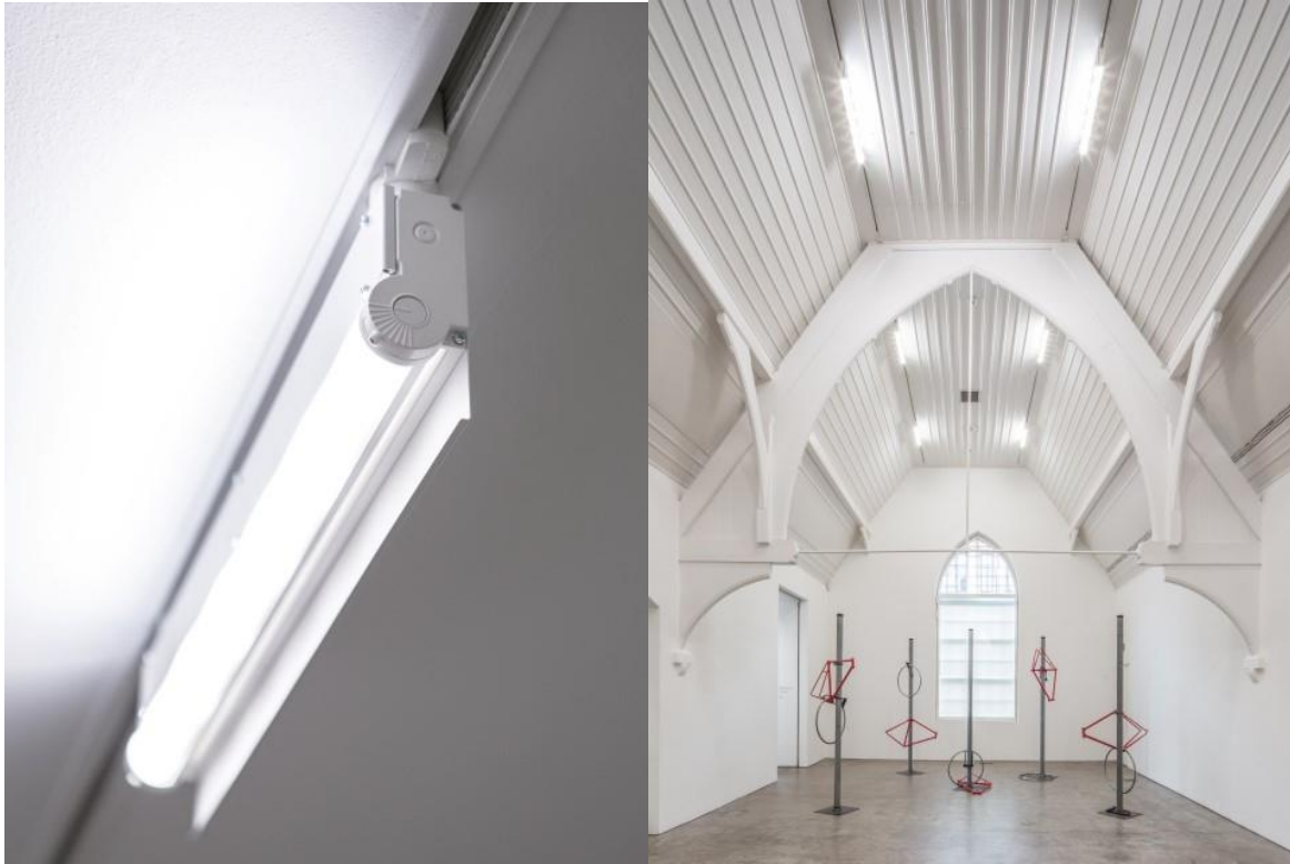
IKON LED, Sofia Hultén exhibition, Ikon Gallery (2017).

Ikon is delighted to announce the launch of the IKON LED; a high quality, multi-solution gallery track-mounted light, co-designed and produced by Ikon with Designed Architectural Lighting (DAL), and funded by an Arts Council England Capital Grant.