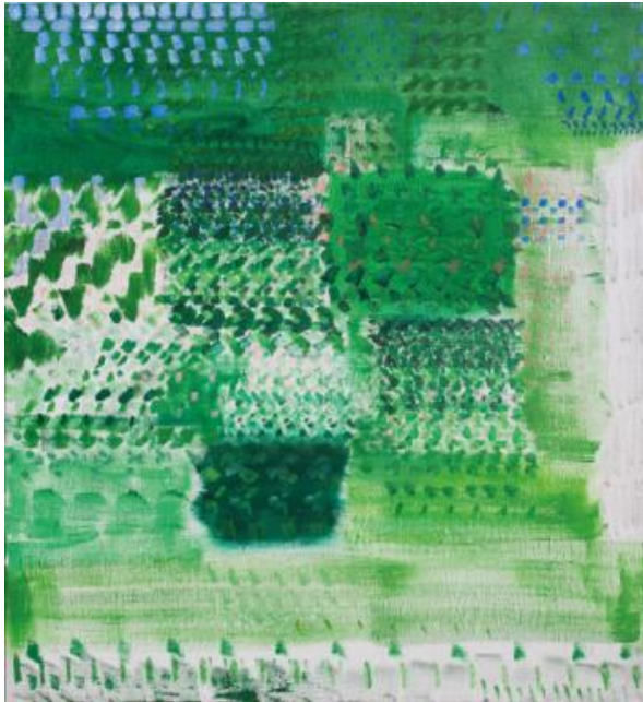
Vladimír Kokolia, Apple Tree (2013) acrylic on canvas

Vladimír Kokolia 4 July – 9 September 2018