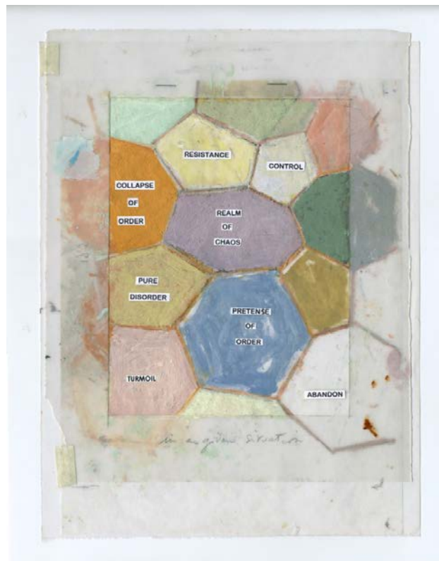
Francis Alijs, Untitled , 2010. Study for In a given situation . Pencil and oil on tracing paper, 32 x 24 x 2 cm. Courtesy the artist.