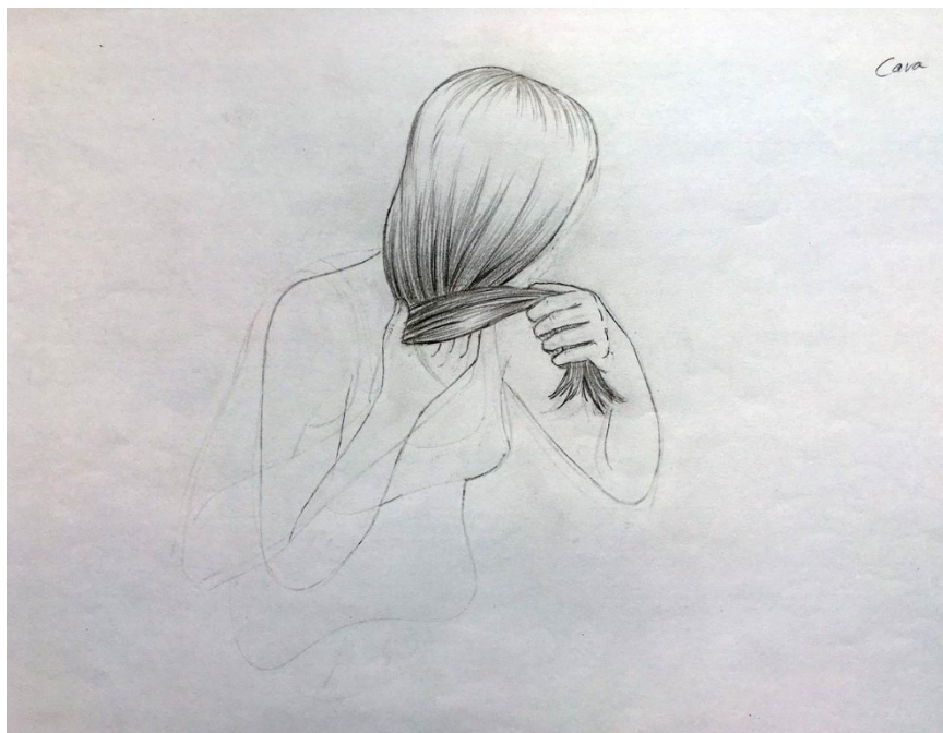
Francis Alijs, Studies for Exodus 3:14 (2013-2017). Animation drawings, pencil on paper, 26.5 x 32 cm each. Courtesy the artist.