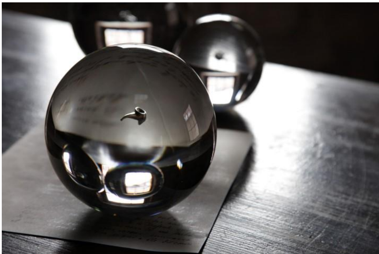
Oliver Beer Silence is Golden (2013) © Oliver Beer

Ikon presents the most comprehensive exhibition to date of work by British artist Oliver Beer. Through film and sculpture, with a strong emphasis on sound, it exemplifies a preoccupation with both the physical properties and emotional value of objects, paradoxically with a focus on emptiness and absence. The exhibition also features a new video piece commissioned by Ikon, comprising of drawings by 2,500 local school and pre-school children.