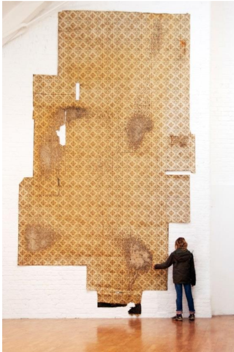
Oliver Beer Oma's Kitchen Floor (2008) Linoleum, 511 x 350 cm, Collection of the artist. Image © Oliver Beer

Ikon Gallery 1 Oozells Square, Brindleyplace, Birmingham B1 2HS 0121 248 0708 / www.ikon-gallery.org Open Tuesday-Sunday & Bank Holiday Mondays, 11am-5pm / free entry Registered charity no. 528892