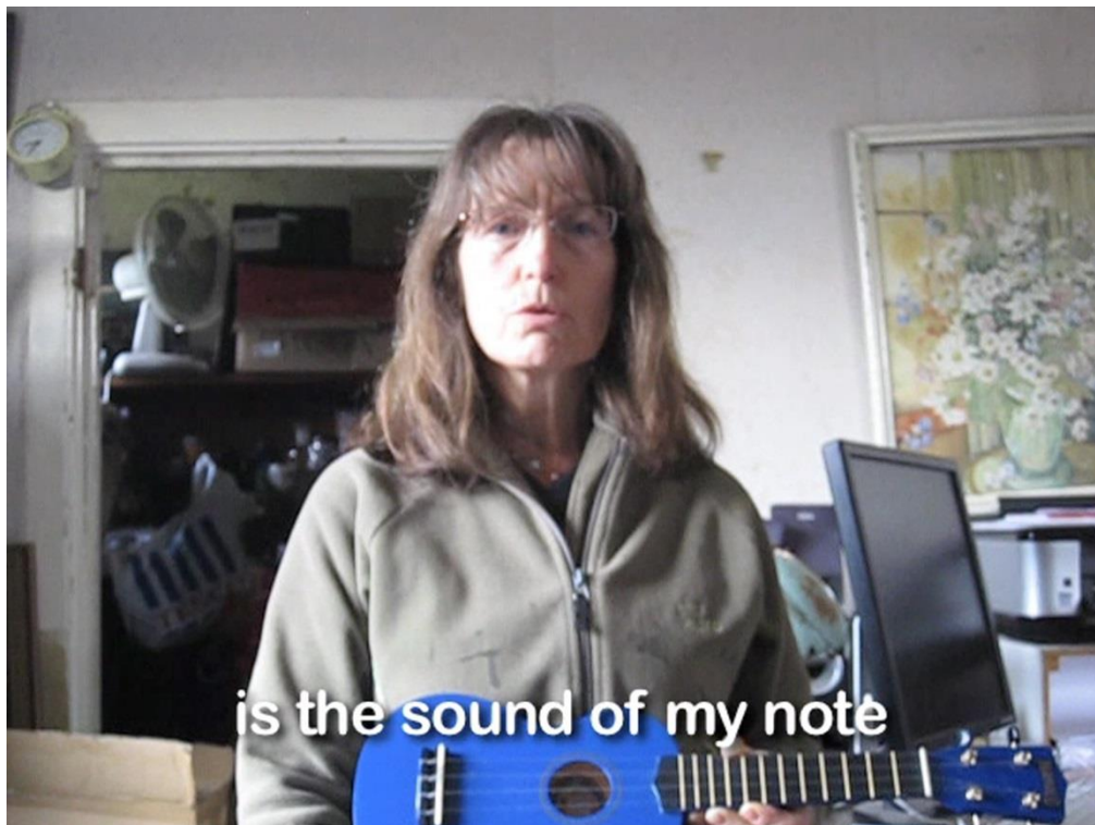
Oliver Beer Mum's Continuous Note (2012) Video, duration 2'50" Image © the artist