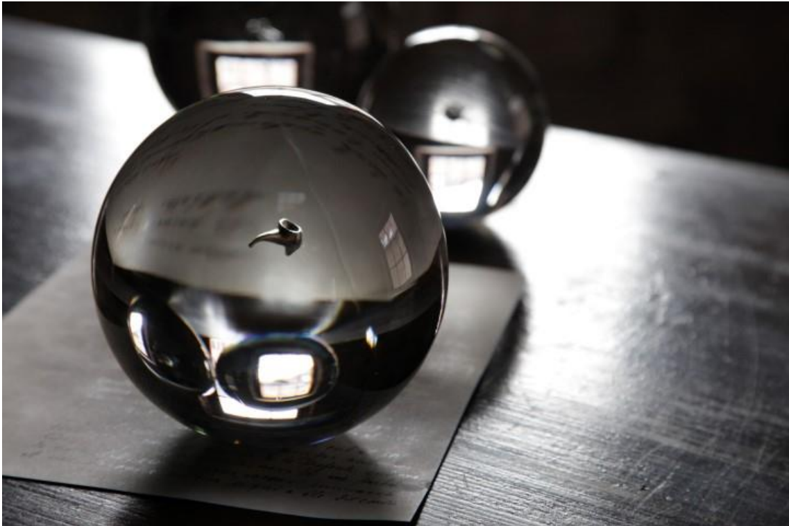
Oliver Beer Silence is Golden (2013) 24 carat gold, lead crystal spheres. Diameter 9 cm, 13 cm, 16 cm

Ikon Gallery 1 Oozells Square, Brindleyplace, Birmingham B1 2HS 0121 248 0708 / www.ikon-gallery.org Open Tuesday-Sunday & Bank Holiday Mondays, 11am-5pm / free entry Registered charity no. 528892