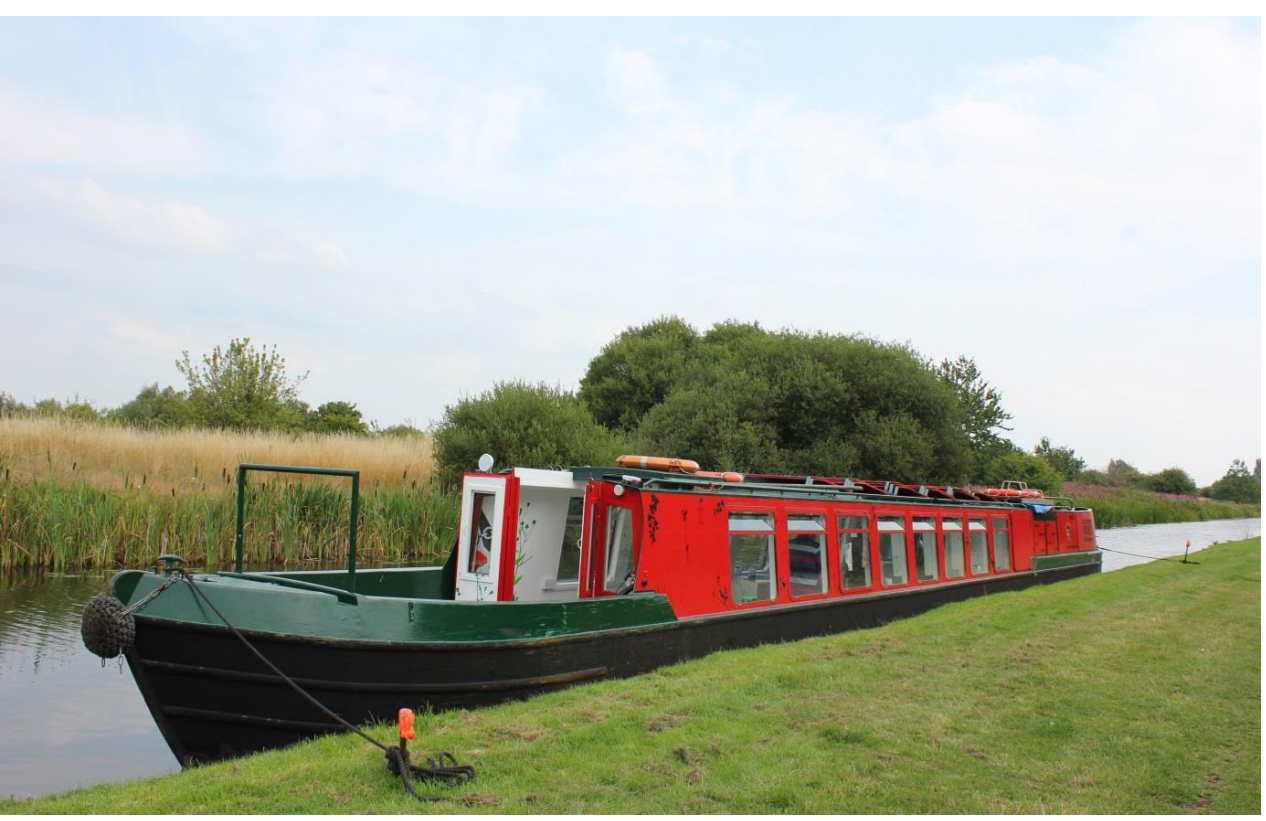
Black Country Voyages