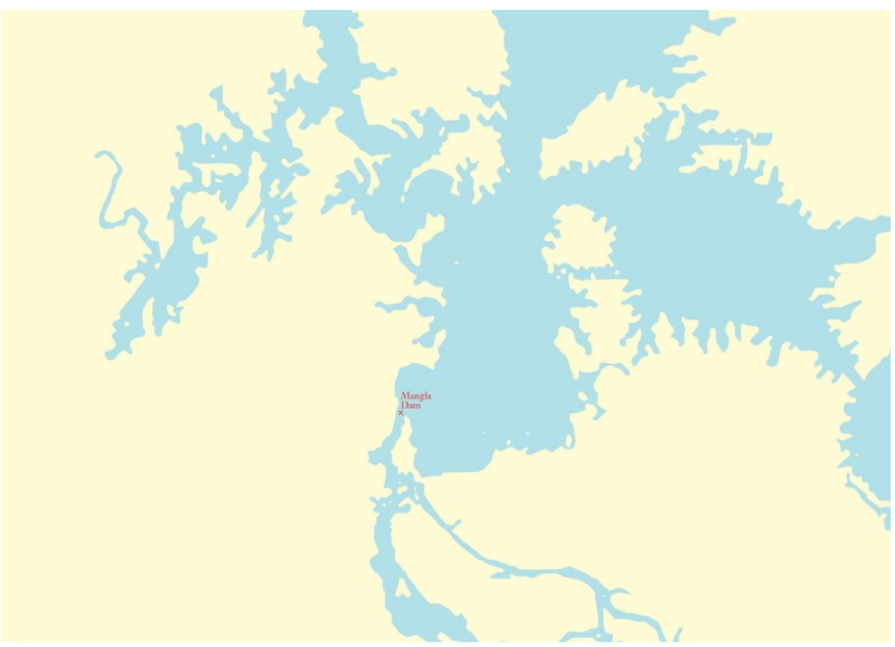
Map of Mangla Dam, located on the Jhelum River in the Mirpur District of Azad Kashmir, Pakistan.