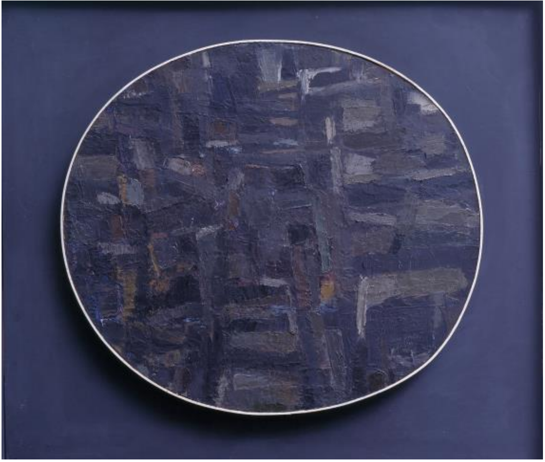
Jesse Bruton, Rising Locks (c.1965). Oil on canvas. Image courtesy of the artist and Midge Skene.