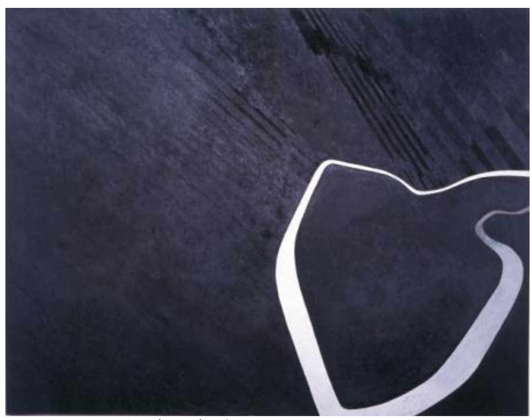
Jesse Bruton, Turnabout (c.1967). Oil on canvas.