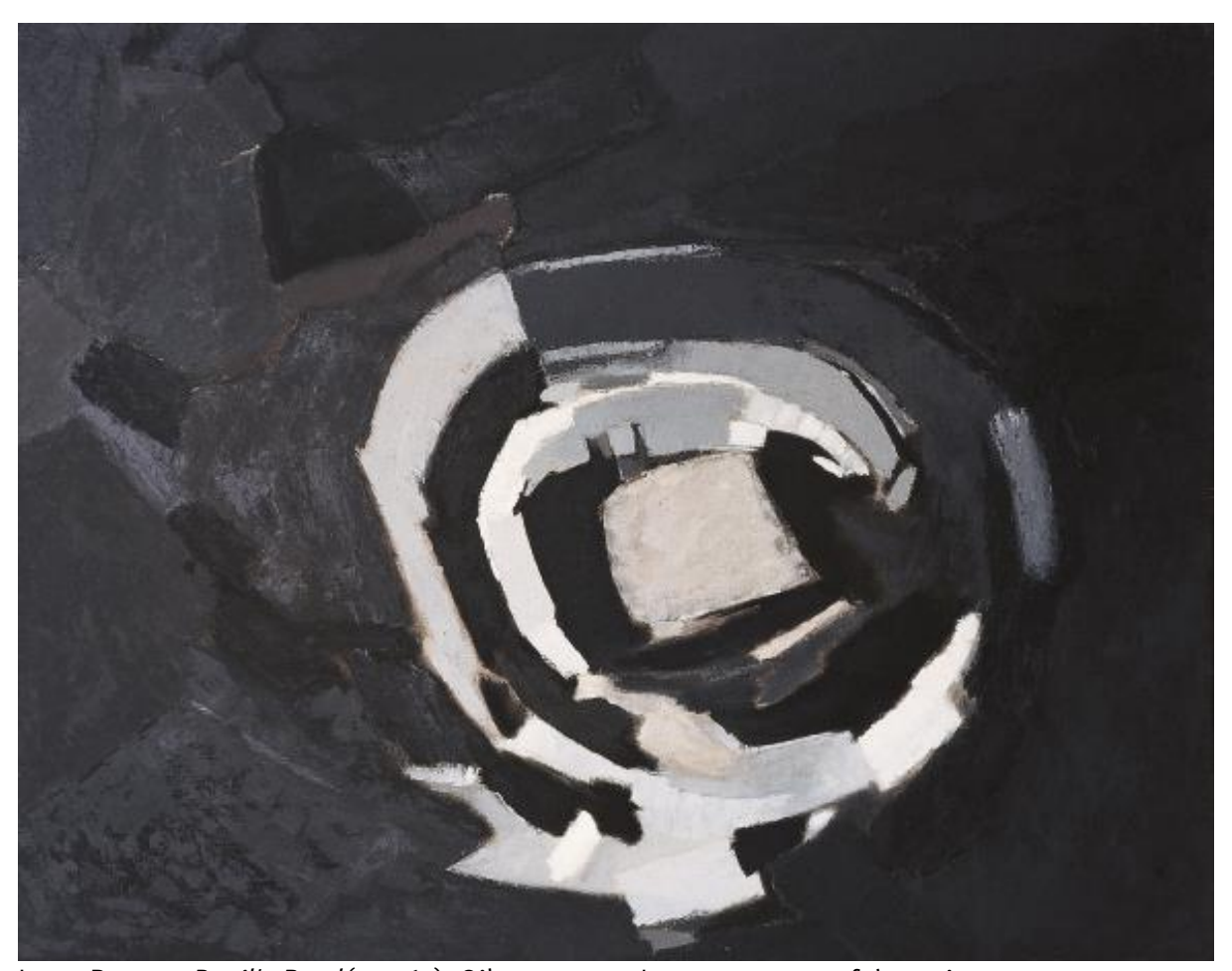
Jesse Bruton, Devil's Bowl (c.1965). Oil on canvas. Image courtesy of the artist.

Jesse Bruton is one of the founding artists of Ikon. This exhibition (6 July – 11 September 2016) tells the fascinating story of his artistic development, starting in the 1950s and ending in 1972 when Bruton abandoned painting for painting conservation.