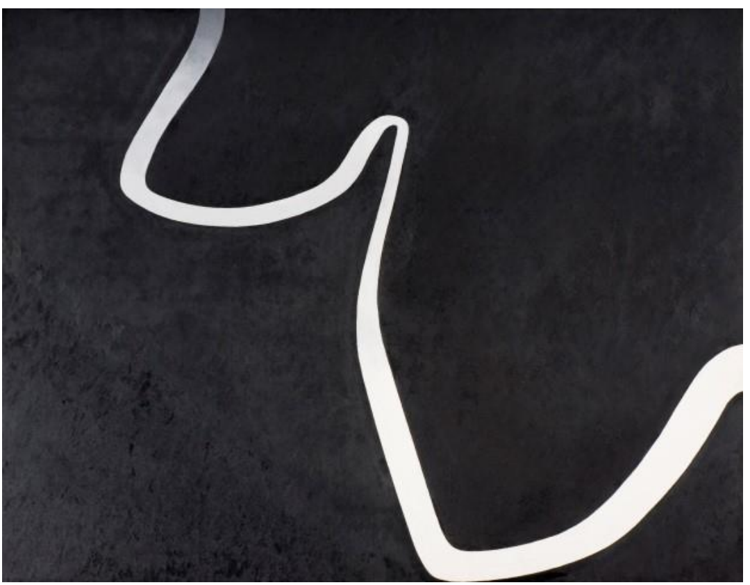
Jesse Bruton, Winding (1968). Oil on canvas © the artist / Photo by Birmingham Museums Trust.