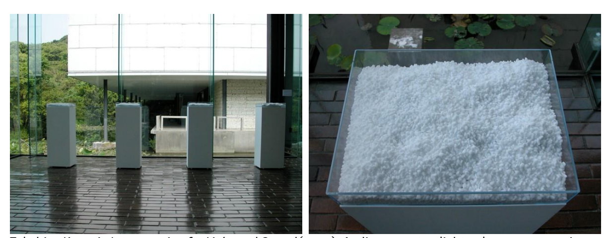
Takehisa Kosugi, Interspersion for Light and Sound (2000). Audio generator, light pulse generator, piezo transducer, LED, sugar and/or sand, plastic container.